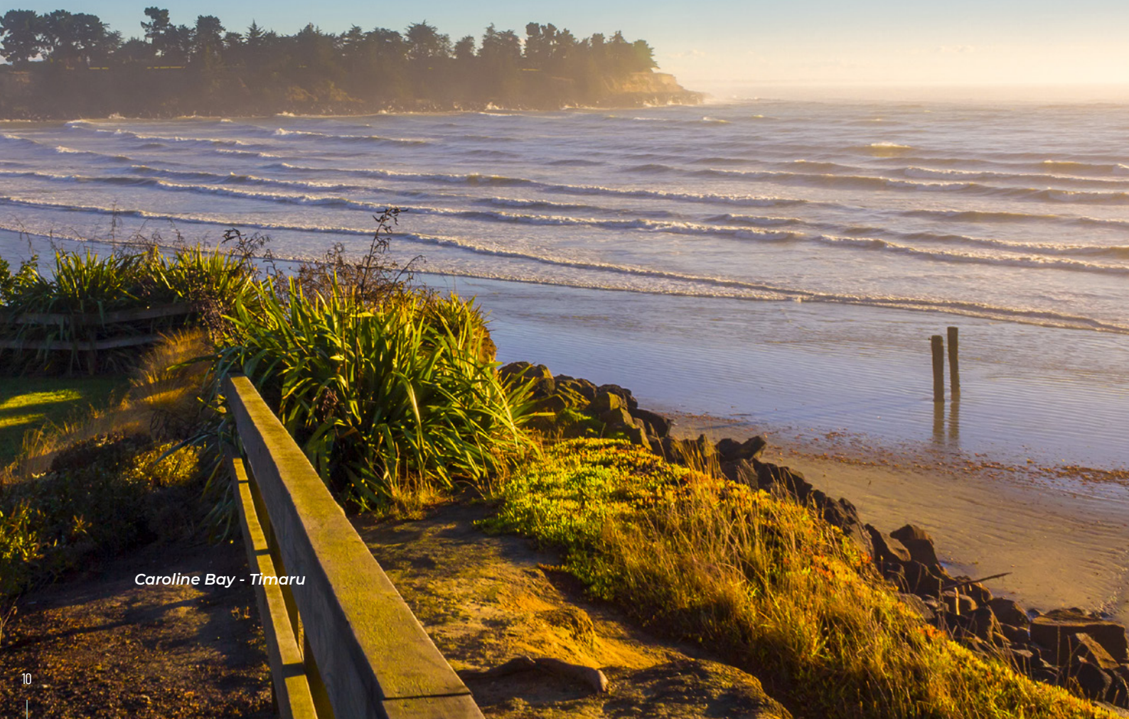
Caroline Bay - Timaru